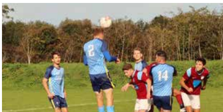
Action from the Lions game on Sunday 5 November against Coton - a good 7-2 win!

The 300 Club tickets (yes, 300 not 200!) are on sale and no doubt the village will support us – as always.